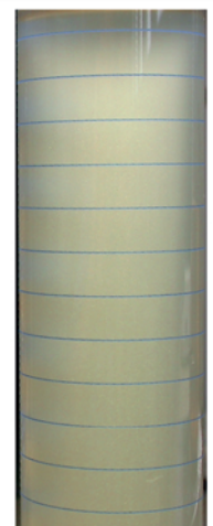
Too much yeasts with respect to the quantity of Clarifiant