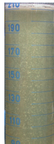
Optimal ratio of yeasts / Clarifiant XL

In general, for optimal riddling, we advise a quantity of 0,04 to 0,05g of bentonite/bottle.